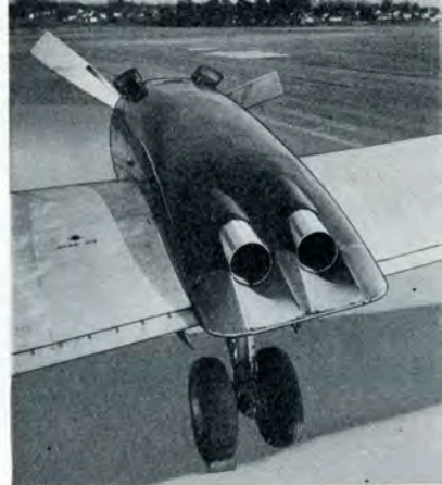
Jet exhaust pulls cooling air through engine and boosts speed.

— compliments of Delta — is quickly and efficiently served by your Delta Stewardess at meal time, from the modern stainless steel galley.