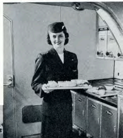
Stainless steel buffet has capacity for 48 trays, heating and chilling facilities.