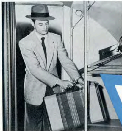
Carry-on baggage may be placed on "book-shelf" racks just inside entrance.

panel, and withdrawn beneath seats. In the same panel the round swivel-unit gives you an individually controllable stream of cool air.