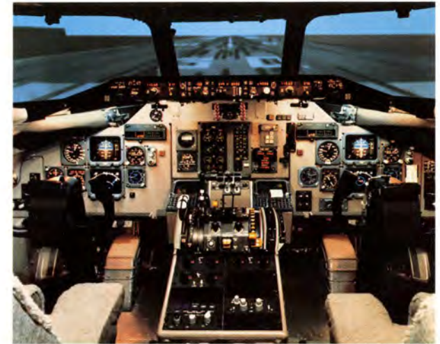
Delta’s MD-90 integrated flight compartment

The superior performance of Delta’s MD-90s allows the aircraft to operate efficiently from restrictive conditions found at “hot and high” airports like Salt Lake City. The MD-90 also has the lowest cumulative noise level of any twin jet. This whisper-quiet aircraft will be every community’s favorite neighbor, especially noise-sensitive airports such as Orange County, California (SNA) and Washington D.C.’s National Airport (DCA).