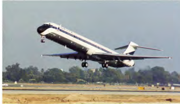
Delta’s MD-90 at McDonnell Douglas

Soon, the most environmentally friendly aircraft in the world will join Delta’s fleet. McDonnell Douglas has combined the traditional durability of its narrowbody airframe with International Aero Engine’s V2500 power plants – the most technically advanced engines in their class. The result is the MD-90, a new aircraft for the 21st century. It is the cleanest, quietest, and most efficient aircraft, with Delta again taking the leadership role as THE FIRST MD-90 operator.