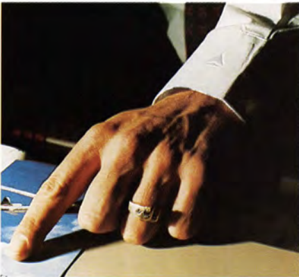
Note detailing on shirt cuff.