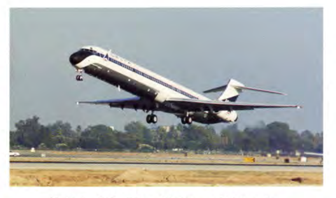
Delta's MD-90 at McDonnell Douglas

Delta's MD-90 has 150 seats, 12 more than its current MD-88s, with the 5-abreast seating that passengers prefer. Delta's passengers will appreciate the quiet, comfortable ambiance of the new MD-90. Amenities include inflight video/audio entertainment, larger and lighted overhead stowage bins, full-grip lighted handrails, vacuum-operated lavatories and wide-aisle spaciousness for ease of movement throughout the cabin.