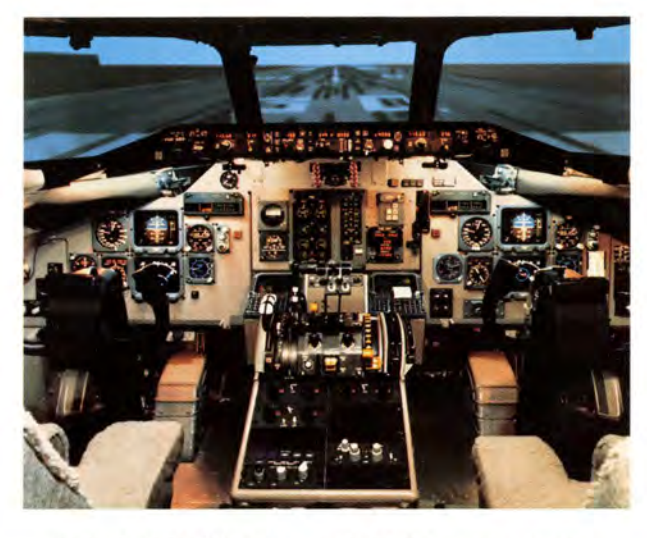
Delta's MD-90 integrated flight compartment

The superior performance of Delta's MD-90s allows the aircraft to operate efficiently from restrictive conditions found at "hot and high" airports like Salt Lake City. The MD-90 also has the lowest cumulative noise level of any twin jet. This whisper-quiet aircraft will be every community's favorite neighbor, especially noise-sensitive airports such as Orange County, California (SNA) and Washington D.C.'s National Airport (DCA).